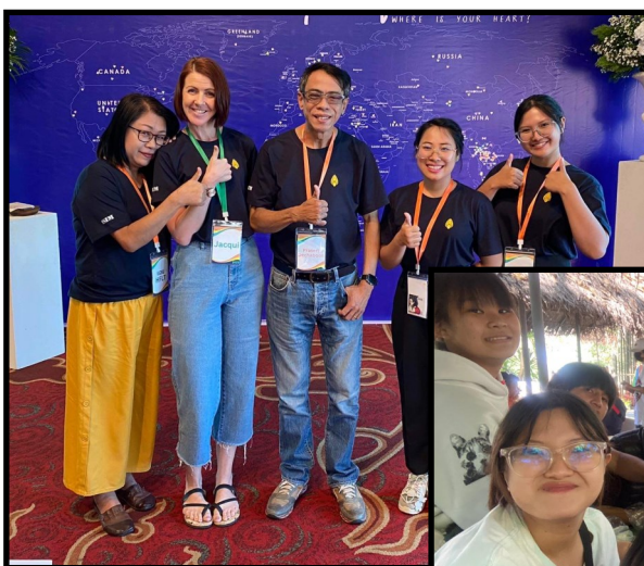
Celebrations with Hope for Life team, Chiang Mai.

With Hope for Life Thailand we will be meeting the new team members, spending time in 'the day in a Thai life', using conversational English, assisting with activities at Shalom House. We will also be drawing on your practical skills and talents to help with project resources. The Thai team are very excited that a group of Kiwi's are heading their way. Our support can not be underestimated in value.